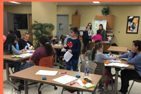
RKids tutor session