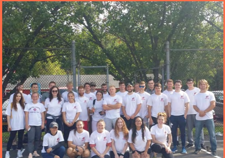
Fig 1. Geography and Biology students after finishing Homer Tree Survey field work, Fall 2019.