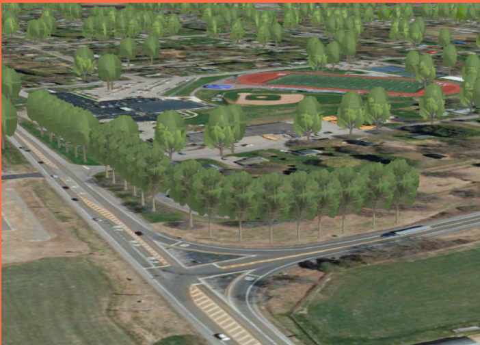
Fig 2. 'Virtual 3D Homer' with proposed new planting locations at 281 Intersection.