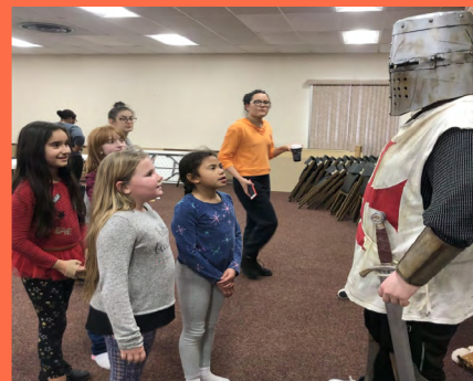
Geneseo Area Gaming Group stopped by RKids in a medieval knight costume