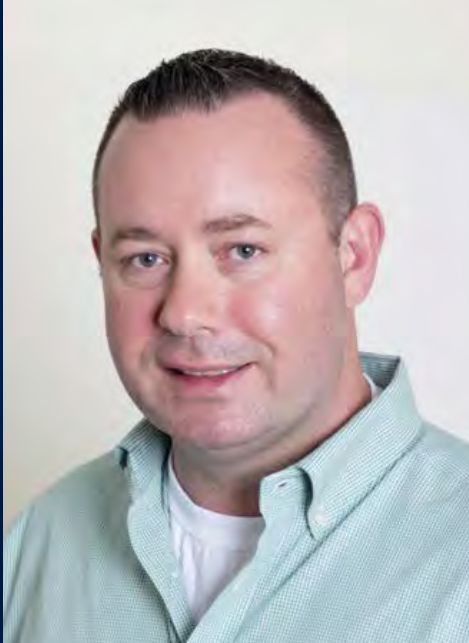
Kevin Murphy Health and Wellness Center