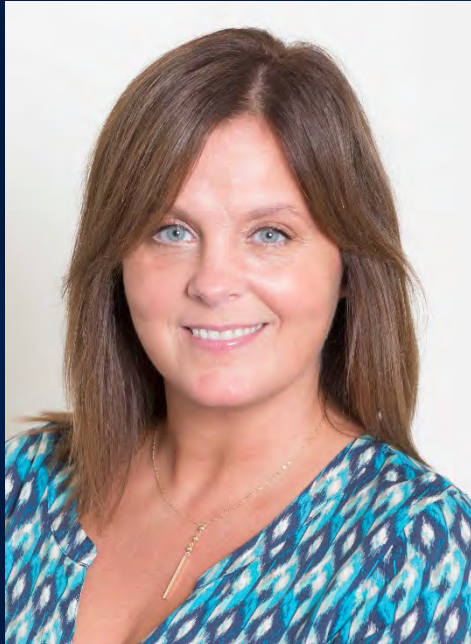
Lynn Marsh Dental Hygiene