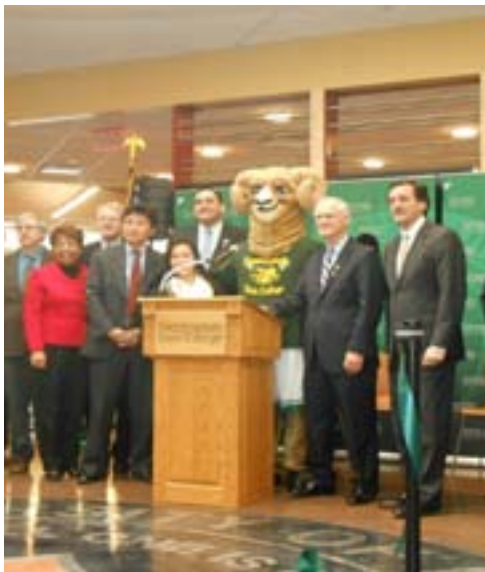
Attendees at the student center ribbon cutting ceremony.

With damage from Sandy still being cleaned up, storms like Nemo are causing increased delays in the process. Although students like snow days, these storms have been disruptive and damaging to people's lives.