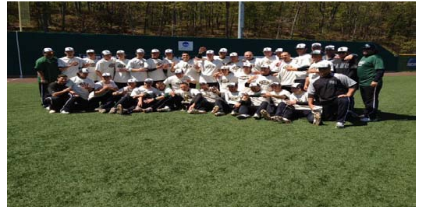
2012 Farmingdale State Rams

After a heroic 2012 season for the Farmingdale State Rams Men's baseball team, it is clear that they are playing with a little extra fire-power for this upcoming spring because of the way things ended just a season ago.