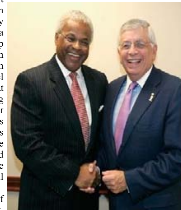
Left: NBA president Billy Hunter, Right: NBA Commissioner David Stern

“It’s decent but now their are teams that have advantages such as The Lakers and Celtics, especially the Celtics with their old legs they should be well rested.