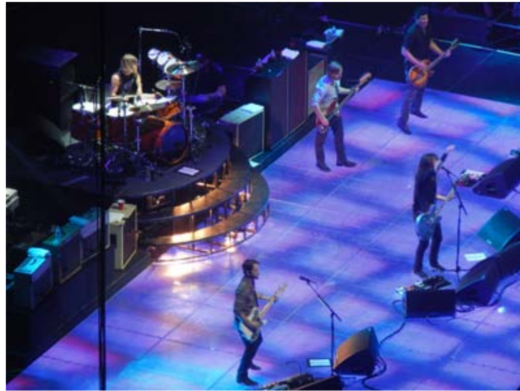
Foo Fighters perform at the Prudential Center in Newark New Jersey

The Foo Fighters stormed into Newark on Monday night to play the Prudential Center, know to audience members as The Rock. As the North American leg of their tour is coming to an end, the atmosphere inside “The Rock” was as if it was the first show of the tour.